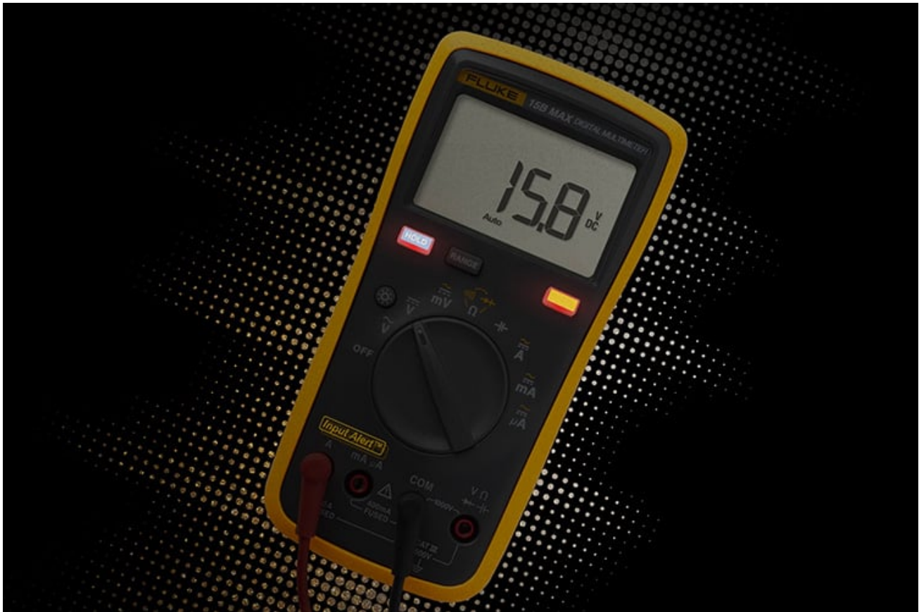
Audible and visual alarm for incorrect connections