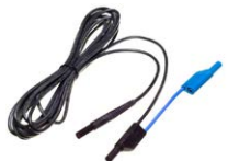
test lead 5 m, black, 1 kV (banana plugs, shielded) WAPRZ005BLBBE