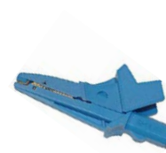
blue "crocodile" clip 1 kV 20 A