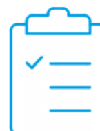
Calibration certificate with accreditation