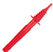
test probe with banana socket; 1 kV; red