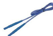
test lead with banana plugs; 1 kV; 1.2 m; blue