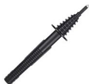
test probe with banana socket; 1 kV; black