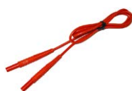
test lead with banana plugs; 1 kV; 1.2 m; red