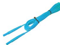
test lead 5 m, blue, 1 kV (banana plugs) WAPRZ005BUBB