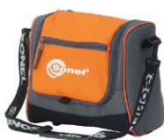
M-6 carrying case