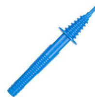
pin probe, blue 1 kV (banana socket) WASONBU0GB1