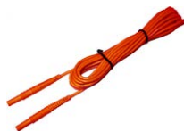
test lead 5 m, red, 1 kV (banana plugs) WAPRZ005REBB